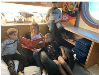
Author visits-Mill Academy/Elementary