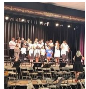
Risers for Chorus-Chase