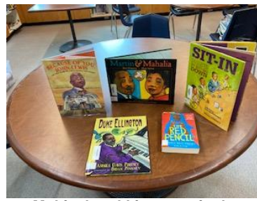
Multicultural Literature in the Classroom-Mill Academy/Elementary